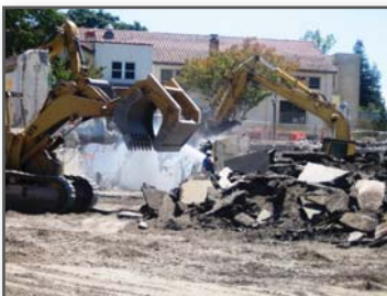
Marin CCD Kentfield campus demolition for New Science & Math Central Plant GC: Lathrop CM: Swinerton Management & Consulting