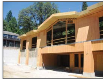
Feather River College, Student Learning Center CM Multi Prime: Counterpoint