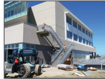
San Mateo College Building 10 Exterior Stairs GC: McCarthy Builders CM: Swinerton Management & Consulting