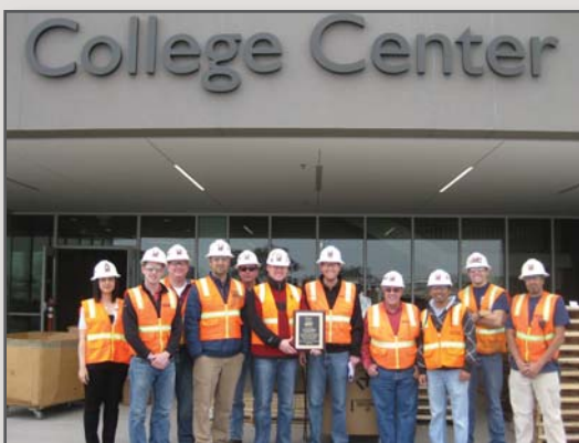
McCarthy Builders San Mateo CCD CIP 2 Design Build Team