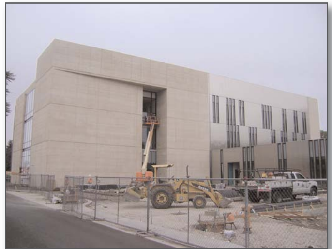
Golden West College Learning Resource Center

There are many who can share in this success, however, URS continues to address project safety in the office and more importantly out in the field.