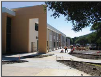
Indian Valley Campus Site Walk