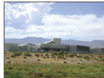
Palm Desert High School Renovation CM: Multi Prime: Ledesma