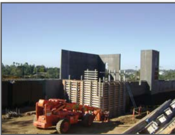
Palomar CCD Industrial Technical Center GC: James Corporation of California CM: Gilbane