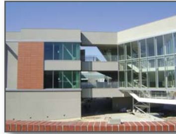
Palomar CCD Multi-Disciplinary Instructional Building CM Multi-Prime: C.W. Driver