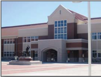
New Pittsburg High School Administration Building GC: S.J. Amoroso CM: RGM & Associates